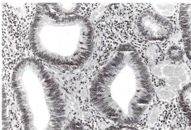
Figure 3: Moderately dysplastic glands within the polyp.