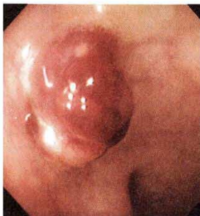
Figure 1: Solitary juvenile polyp in the lower sigmoid colon.