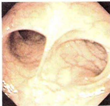
Figure 1: Colonoscopic view from the wide segment on the bifurcation, with normal wide openings into the blind loop.

Radiological contrast imaging of the colon then revealed a sigmoid segment with a lumen that was twice as wide as the rest of the colon. The blind loop opened into this broad segment, and the distal end divided, one arm passing into the descending colon and one arm running distally in the direction of the rectum (Figures 2, 3). The left and the right part of the fused segment showed separate contraction waves, showing also that the two parts were controlled by distinct parts of the enteric nervous system. Tubular duplication of the colon, which can also lead to fecal retention, was therefore not present (1), but a congenital fusion of two sigmoid segments situated side by side. This malformation has not previously been mentioned in the literature.