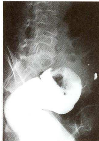
Figure 2: Barium enema, showing a clawlike finding in the rectum.