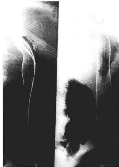
Figure 1: An implanted Ultraflex prosthesis with incomplete unfolding at the proximal end in an extensive stenosis. Left: before balloon dilation, right: after balloon dilation using the Olbert Catheter System.