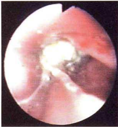
Figure 2: Esophagoscopy, showing mid-esophageal perforation, with a barium residue.