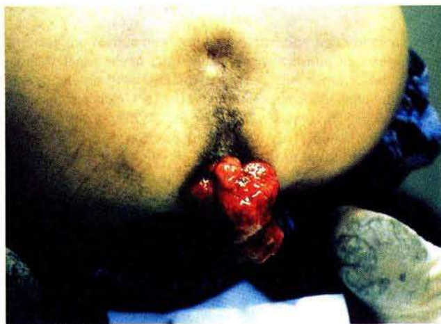
Figure 1: View of the prolapsing rectal polyp.