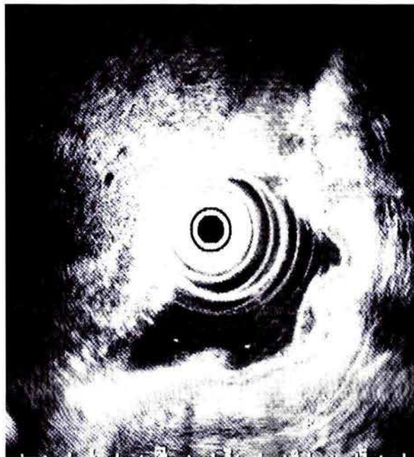
Figure 1 Endoscopic ultrasonogram obtained from the proximal stomach reveals an obvious thickening of gastric wall (+), predominantly of the submucosa layer (x)

Gastrointestinal endoscopy revealed pan-gastric ulceration. Endoscopic ultrasonography (GF-UM 20; Olympus, Tokyo, Japan) showed a thickening of the stomach wall (15 mm) suggestive of gastric linitis (Figure 1). Gastric histological examination showed an ulcerated mucosa. Gastric percutaneous ultrasound-guided biopsy was negative, and a laparotomy was carried out for a large gastric biopsy. Histological