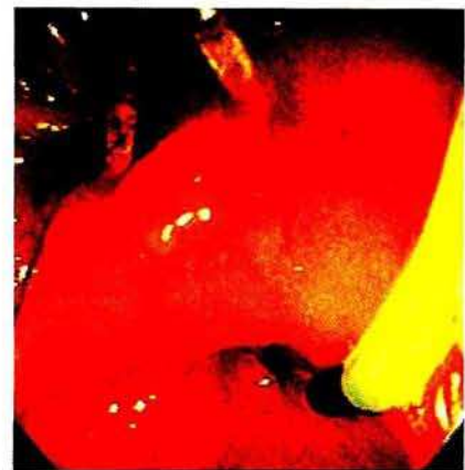
Figure 2: Cannulation was easily performed after the duodenal papilla had been exposed by anchoring the redundant Kerckring's fold to the duodenal mucosa cephalad with two clips.