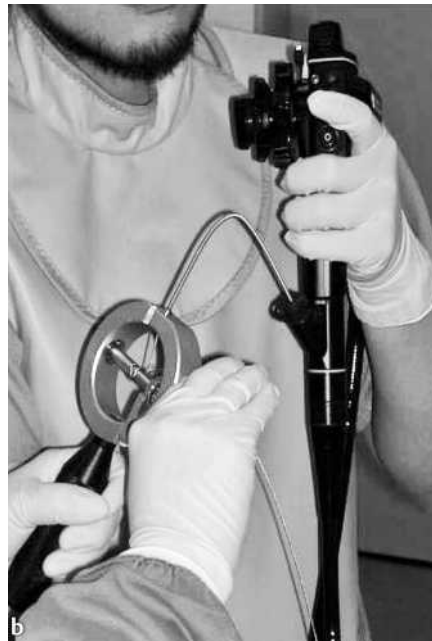
Figure 1 a The newly developed endotripter consists of three coiled metal sheaths 53 cm long and 2.4 mm in diameter. b The end of the endotripter is gripped in a vise.