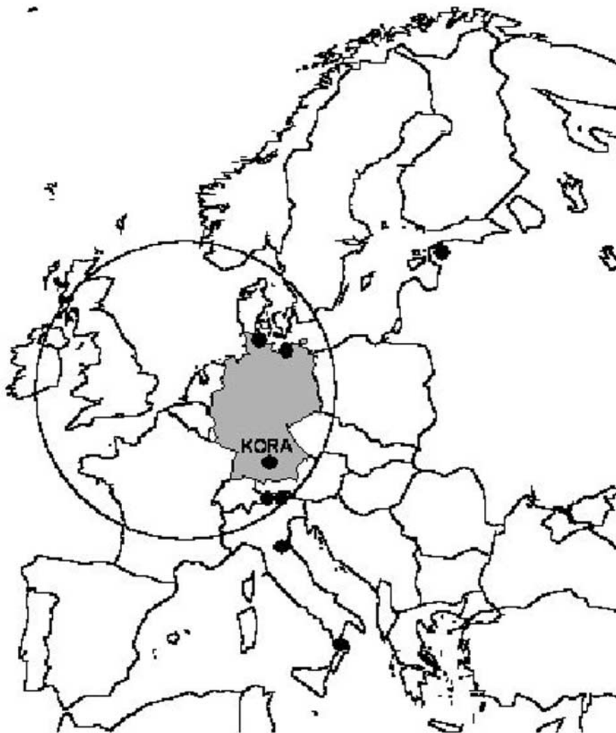
Fig. 2 Study populations of the Germany study on Genomic Controls (GC) (high-lighted): KORA, SHIP and POPGEN (each n = 720 ) and of the European Study on Linkage Disequilibrium (LD): KORA ( n = 170 ), SHIP ( n = 100 ), POPGEN ( n = 160 ), samples from Estonia ( n = 170 ), South Tyrol ( n = 170 ), Ladinia ( n = 160 ), Brisighella ( n = 98 ) and Calabria ( n = 100 ); the circle represents the emigration region of the HapMap CEPH trios ( n = 90 ), that were used as a reference population. The KORA population is a random sample of the KORA survey S4 (1999/2001).

tragenic regions. All SNPs are uniformly dispersed throughout the genome and have moderate allele frequencies. After the selection process, these SNP loci have been used for the Genomic Control (GC) and Structured Association (SA) methods. Both methods are based on the idea, that population substructure does not only affect the candidate genes, but can be seen across the whole genome. Alleles that are not associated with the disease or candidate genes can be used to estimate the effect of population stratification in the sample and to identify the underlying subgroups. In the method of Genomic Control, for example, a factor is estimated, which is used for the appropriate correction of results derived from case-control association analyses. The genotyping for this study and the quality management is still in progress. First results will be made publicly available in 2005.