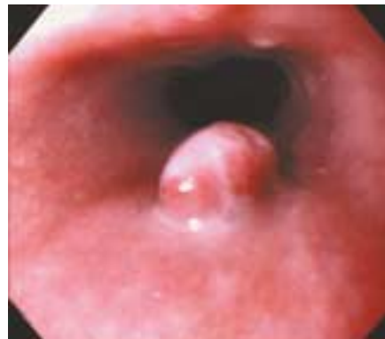
Figure 2 Endoscopy reveals a sessile, protruding lesion. The base is brownish-red and the top is whitish in color.