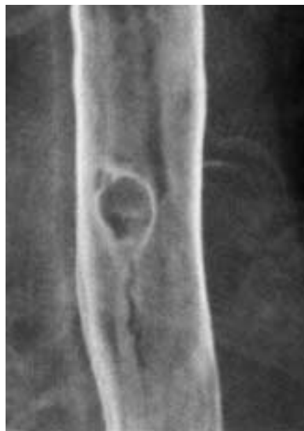
Figure 1 The barium meal examination shows a round radiolucent area, measuring 8 mm in diameter, in the middle third of the esophagus.