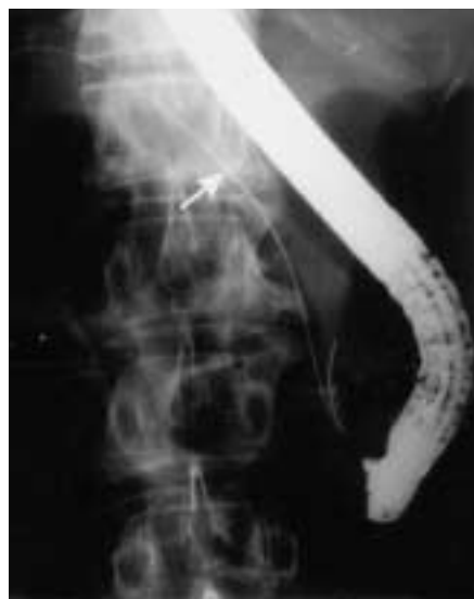
Figure 1 One guide wire has been passed into the pancreatic duct and another is being moved in the direction of the bile duct through the papillotome inserted into the ampulla.

All of the abovementioned techniques are aimed at assisting the endoscopist, shortening the duration of procedures, and decreasing the risk of complications. Another advantage is safety even during the clinician's learning curve for the procedures [1], when repeated cannulation and overfilling of the pancreatic duct is a real danger, and correction of failed attempts is difficult because of papillary damage.