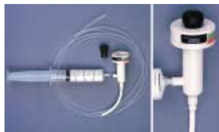
Figure 1 The outer sheath of a clipping device, with an original rubber cap and a 20-ml disposable syringe containing sucralfate.