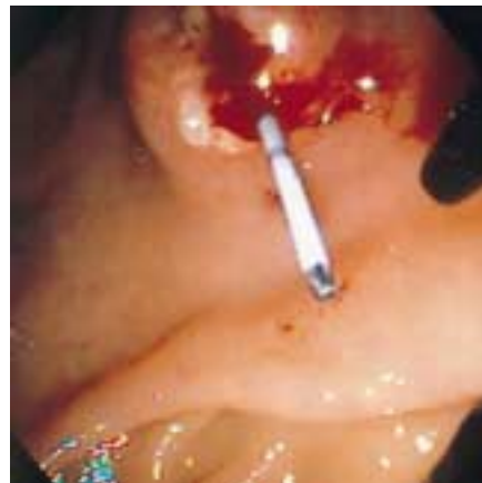
Figure 2 Endoscopic visualization of a guide wire which has been placed through a T-tube, advanced through the CBD and is now exiting the papilla of Vater. A catheter will be advanced over the wire into the CBD.