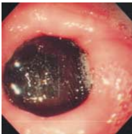
Figure 1 Endoscopic image of coin acting like a “ball-valve” at the pylorus. The coin was adherent to the mucosa in the duodenal cap by one of its edges, about which it appeared to swing