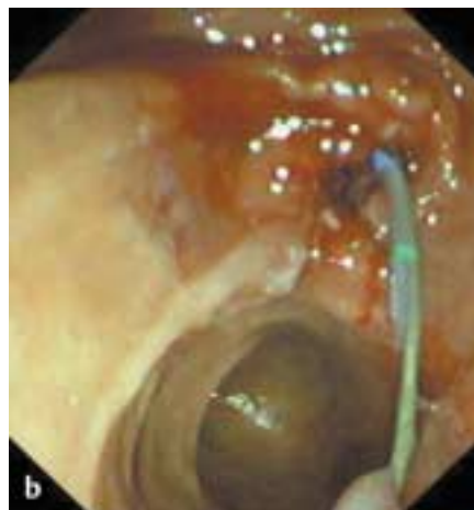
Figure 2 a Fluoroscopy showing antegrade placement of the papillotome under endoscopic control. b Endoscopic control of the antegradely inserted papillotome