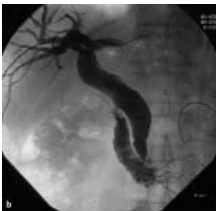
Figure 1 a Before antegrade endoscopic papillotomy (EPT), no spontaneous flow of contrast is seen. b Improved flow is seen after antegrade EPT