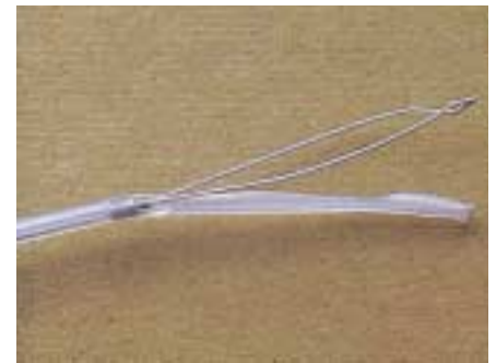
Figure 2 Side-type snare wire after the wire has been released from its plastic cover