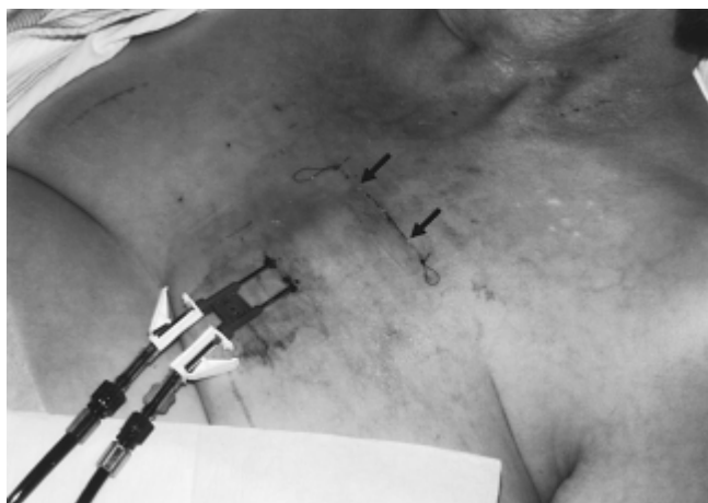
Fig. 2 Dialock port system in use for hemodialysis (1 week after implantation): Port system punctured by twin needle-cannulas. → Suture of the port pocket.

using ultrasound. Preferably the right side was chosen for access. In two cases with occlusion or high-grade stenosis of the right brachiocephalic vein the left jugular vein was accessed. After local anesthesia (Meaverin, Mepivacainhydrochlorid 1%, Rhone-Poulenc-Rorer GmbH, Köln, Germany) and double puncture of the vein the two catheters were inserted through a peel-away sheath. The catheter tips were placed at different levels in the right atrium under fluoroscopic control. For implantation of the port local anesthetics (Meaverin) were distributed sparsely into the subcutaneous tissue of the anterior chest wall a few centimeters below the clavicle. After a transverse incision of 6 cm length a pocket was prepared. The catheters were tunneled from the venous access site to the port pocket and connected to the port. After fixation of the port to the pectoral fascia the pocket was closed by suture.