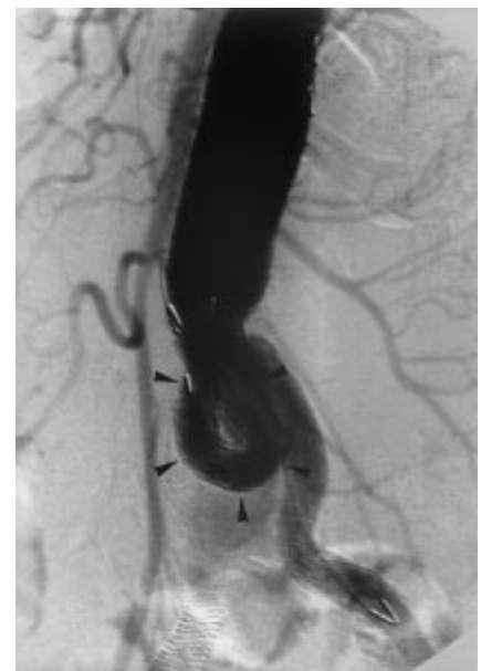
Fig. 4 An angiography reveals the cranial migration and folding of the right iliac stent-graft (arrowheads) into the reperfed aneurysmal sac.