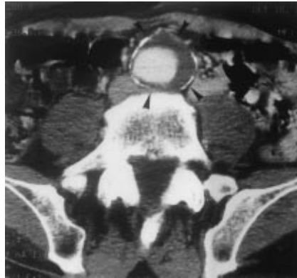
Fig. 1 Preoperative CT scan shows the AAA (arrowheads) with a maximal diameter of 50 mm. Note the circumferential mural thrombus.

and by spiral CT scan, after 1 week, 3, 6, 12, 24 and 36 months. The consecutive spiral CT-scans showed a complete exclusion of the aneurysm and good patency of the stent-graft. We also noted a gradual decrease of the maximal diameter of the thrombosed aneurysmal sac, which was 50 mm immediately after exclusion, to 30 mm after 3 years (Fig. 2). Control physical examination 4 years after stent-graft implantation revealed a pulsatile mass and spiral CT scan