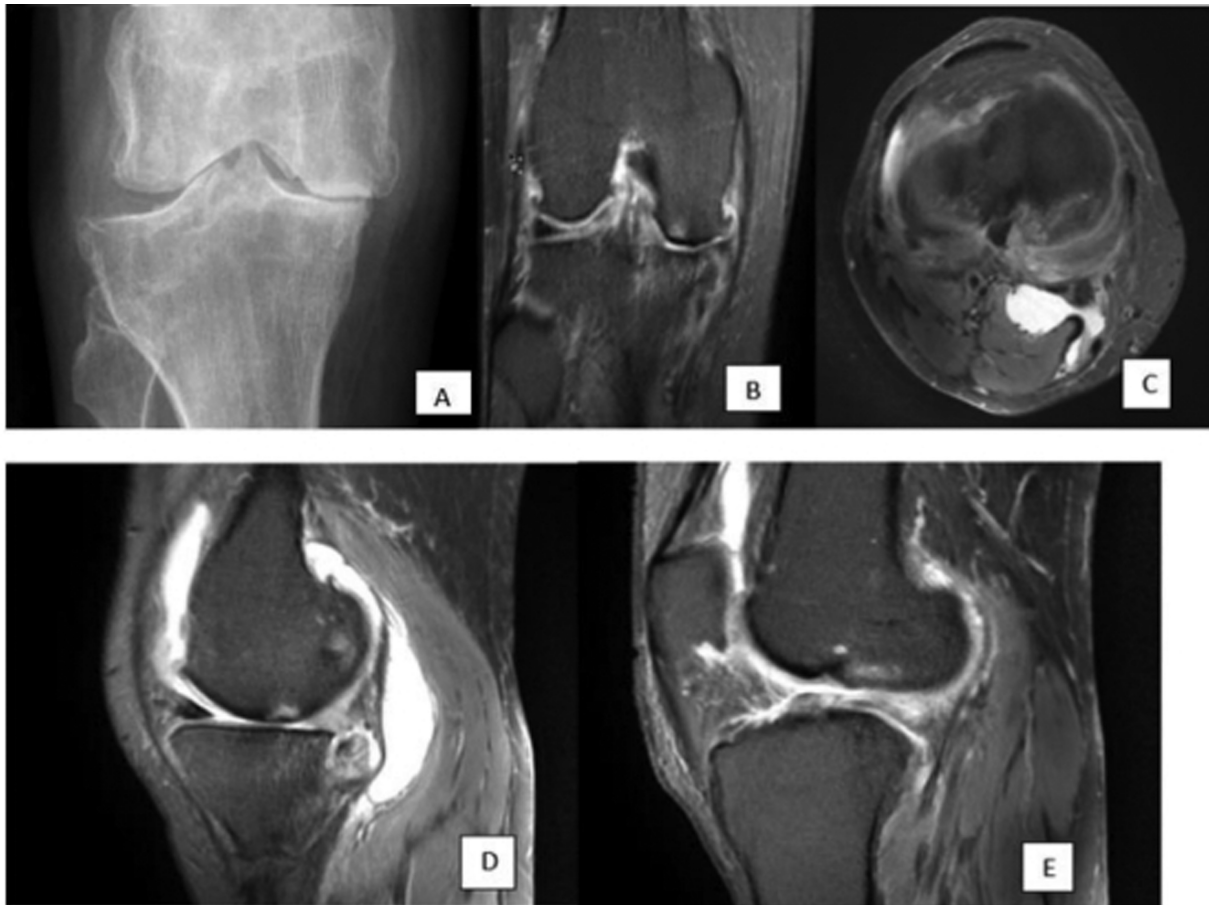
Fig. 3 (Representative case). A 39-year-old woman presented with bilateral knee pain for the past 2 to 3 years. Her Western Ontario and McMaster scoring system (WOMAC) total pain score was 12/20. (A) Posteroanterior (PA) X-ray shows severe reduction of medial joint space with large osteophytes, subchondral sclerosis, and subchondral cysts suggesting Kellgren–Lawrence grading system (K-L) grade 4. (B) Coronal proton density fat-saturated (PDFS) image shows full-thickness cartilage loss in the medial femoral and tibial articular surface with large osteophytes and severe narrowing of the joint space. (C) Axial PDFS image shows Baker's cyst between the tendons of semimembranosus and medial head of the gastrocnemius. (D) Sagittal PDFS image shows complete maceration of the posterior horn of the medial meniscus. (E) Sagittal PDFS image reveals complete anterior cruciate ligament (ACL) tear.

also observed that the prevalence of OA increases with increased age. 6–9