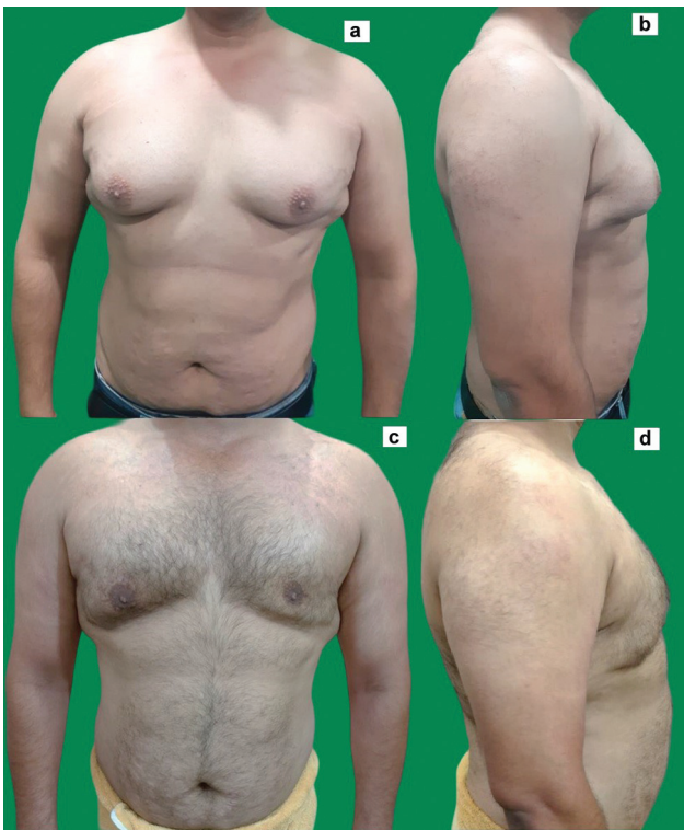
Fig. 2 (a,b) Preoperative and (c,d) postoperative photographs of a patient with grade 4a gynecomastia. Although the skin has retracted greatly, there still is some amount of skin excess.