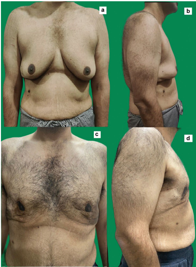
Fig. 6 (a,b) Preoperative and (c,d) postoperative photographs of a patient after massive weight loss with grade 4b gynecomastia. Although skin was thin with poor quality and large number of stretch marks, skin retraction was achieved to near absence of loose skin and disappearance of the inframammary fold (IMF).

through the axillary incision and no infection caused by drains was noted by us in our series. The patients remained comfortable and no analgesics needed to be added beyond those administered to patients who did not have a drain (grade 4a). It has been noted by the authors that even early removal of the drain leads to increased incidence of seroma. The purpose of drain insertion by us is not to prevent hematomas. Although some studies suggest that drains do not have any added advantage in a gynecomastia surgery, they either have a lower grade of gynecomastia or a very small number of cases. 20,21