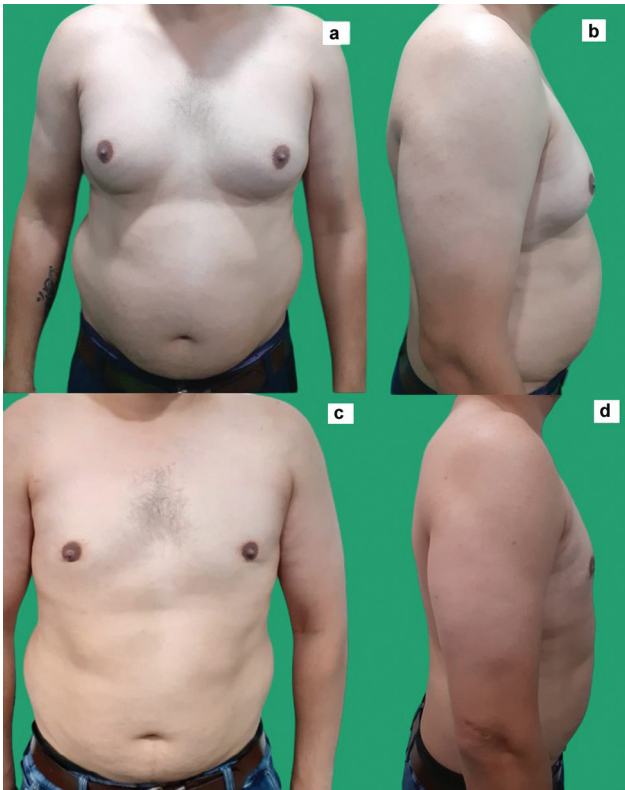
Fig. 1 (a,b) Preoperative and (c,d) postoperative photographs of a patient with grade 4a gynecomastia. The skin has retracted completely and the inframammary fold (IMF) is obliterated.