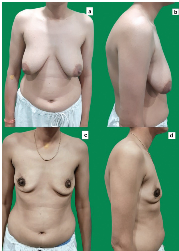
Fig. 8 (a,b) Preoperative photographs of a patient with grade 4b gynecomastia with very severe ptosis. (c,d) Postoperative photographs after the second stage of peri-areolar skin excision. Minimal scars are seen and the patient is satisfied.