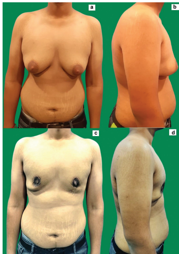
Fig. 5 (a,b) Preoperative and (c,d) postoperative photographs of a patient with grade 4b gynecomastia. Skin has contracted significantly but loose skin around the inframammary fold (IMF) persists.

Skin contraction is usually known to occur over a period of 6 months to even 1 year after liposuction. 9,12 VASER liposuction is known to preserve elastic connective tissue and dermis, leading to skin retraction. 9 The larger the volume of liposuction, the longer the time taken for skin retraction. 13 Due to this, the authors believe that a second stage to excise extra skin should be planned at least 6 to 9 months later. Similar view is held by other surgeons as well. 14 Mett et al did liposuction and gland removal for grade 2b gynecomastia where they noted that skin contracts in 3 months. However, for the largest grades they continued to do reduction with inferior pedicle and horizontal scars across the chest. 4 Abdelwahab et al also measured skin retraction at 3 months postsurgery in grade 3 gynecomastia and found significant skin retraction and repositioning of the NAC. 15 Ramasamy et al measured the amount of skin contraction after liposuction and gland excision objectively. 16 The measurements were done preoperatively and at 6 months postoperatively. Significant retraction of skin, elevation of the NAC, and reduction in area of the NAC were seen in all grades of gynecomastia, with maximum changes in severe grades of gynecomastia. However, the study does not mention residual skin laxity and other outcome parameters for grade 4 gynecomastia patients.