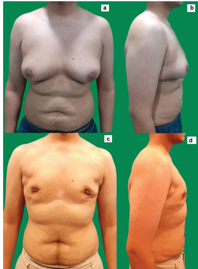
Fig. 3 (a,b) Preoperative and (c,d) postoperative photographs of a patient with grade 4b gynecomastia. He has a very good quality skin, which has retracted completely. Scars of the nipple-areola complex (NAC) lift are barely visible.

of gland through an infra-areolar incision allows a minimally invasive approach to the chest causing least visible scars with an excellent result in the lower grades. However, it is not universally accepted as the procedure of choice for severest grades of gynecomastia. To the best of our knowledge, there is no study in the literature that discusses the long-term outcomes of treatment of grade 4 gynecomastia. Although we used the Gupta and Punia classification for its objectivity, these cases are similar to Rohrich's grade 4 gynecomastia and the readers may use either of them.