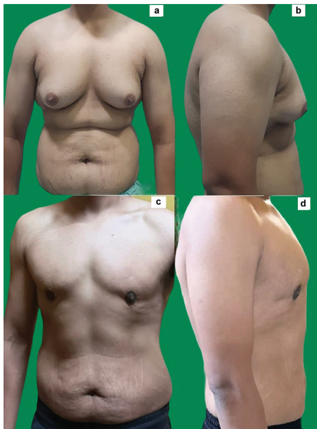
Fig. 4 (a,b) Preoperative and (c,d) postoperative photographs of a patient with grade 4b gynecomastia. Please note the excellent retraction of skin, especially after his weight loss and fitness journey.

lose weight. 11 However, all our patients were very much concerned about a femalelike chest and postsurgical scars and their minimization.