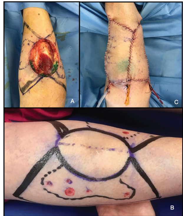
Fig. 2 (A) Postradicalization tissue defect. Detail of the underlying Achilles tendon. (B) Preoperative marking of the type III keystone design perforator island flap (KDPIF) before radicalization of a Merkel cell carcinoma of the Achilles tendon region in a 62 year old man. The perforators were marked as red dots. (C) Immediate postoperative. Two suction drainages in place.

Patients with skin defects who underwent reconstructive surgery using a KDPIF from January 2020 to May 2023 at our department were retrospectively reviewed. Given the retrospective nature of the study, approval of the ethical committee was not necessary. All patients enrolled in the study had signed an informed consent prior to surgery. Demographic data (age, sex, characteristics of skin defects, comorbidities, smoking habits), type of KDPIF, postoperative complications, wound dressing, and follow-up were revised. All the patients underwent accurate surgical debridement of the wound before preparing the flap. Four KDPIFs were used to reconstruct the lower leg area, 2 for the neck region, 1 for the shoulder, 1 for the fourth finger of the hand, 1 for the ischiatic area, 4 for the skin overlying the Achilles tendon, and 1 for