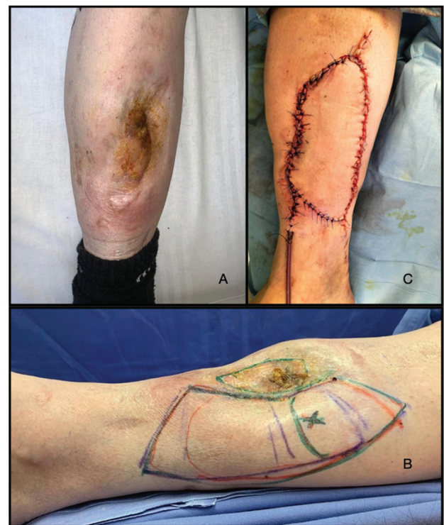
Fig. 4 (A) Preoperative picture of a chronic wound with underlying chronic osteomyelitis of the anterior region of the leg in a 48-year-old man. (B) Marking of the type IV keystone design perforator island flap (KDPIF) with evidenced of the main perforator (green cross). (C) Immediate postoperative. One suction drainage in place.

Unlike free flaps or perforator flaps, the KDPIF is simple in its dissection and does not require any preoperative imaging. Behan first described four variations of the flap, each one suited for specific reconstructive issues. Type I does not allow fascia dissection and is suitable for defects up to 2 cm in width; type IIA is ideal for greater cutaneous defects located over muscular compartments since the deep fascia has to be dissected along the outer curvature of the flap; type IIB differs from type IIA for the grafting of the donor area in body