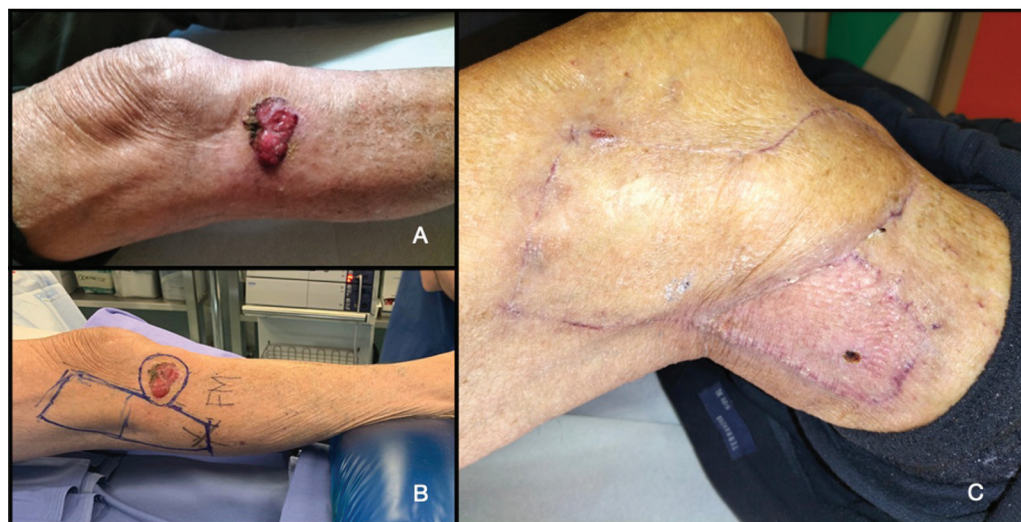
Fig. 1 (A) Ulcerated lesion (which later was diagnosed as a squamous cell carcinoma) of the lateral subpatellar region in an 87-year-old man. (B) Flap marking; type IV keystone design perforator island flap (KDPIF). (C) Picture of the fully healed lesion at the 1-month follow-up.

the skin overlying the knee. The average defect size was 15.9 cm 2 (range: 2–48 cm 2 ). All classical KDPIF variants were utilized: type IIA was the most frequent (6 patients, 46.2%), followed by type IV (3 patients, 23.1%; ► Fig. 1 ), then type IIb (1 patient, 7.7%), type III (1 patient, 7.7%; ► Fig. 2 ), and type I (1 patient, 7.7%). Patients' demographics are listed in ► Table 1 .