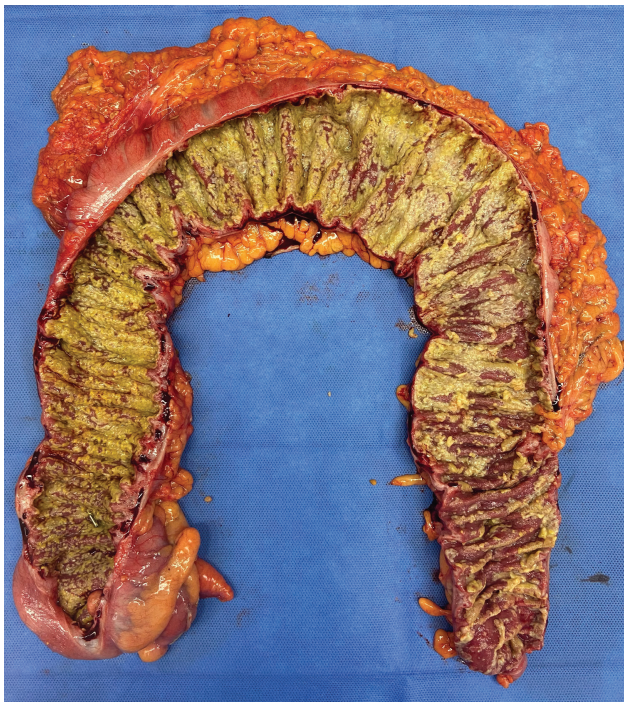
Fig. 2 Surgical specimen with colonic wall thickening and pseudomembranes on the mucosa.

pressor requirements, and a change in mental status prompting emergent intubation for airway protection. The colorectal surgery team was consulted for evaluation of fulminant colitis. The patient was taken for emergency surgery and a