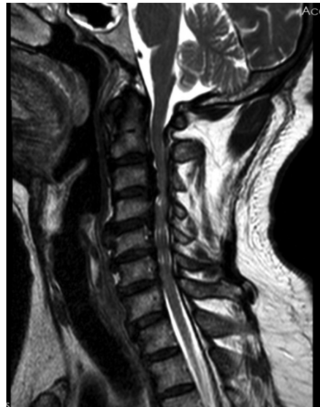
Fig. 1 Preoperative magnetic resonance imaging (T2 sagittal) showing severe cervical canal stenosis with myelopathy at the C3–C6 level.

irritative discharges in the right biceps brachii immediately after rod placement on the right side (►Fig. 2A), indicating mechanical irritation of the right C5–C6 nerve root. After notifying the surgeon, the surgical field was irrigated with warm saline, and the rod was taken out. Despite all measures, raw EMG irritative discharges in the right biceps brachii muscle persisted. A posterior foraminotomy was performed at the right C5 and C6 levels as a second measure, and the amplitude of the irritative discharge (right biceps brachii) in the raw EMG recording decreased immediately (►Fig. 2B). The irritative EMG discharge in the right biceps brachii