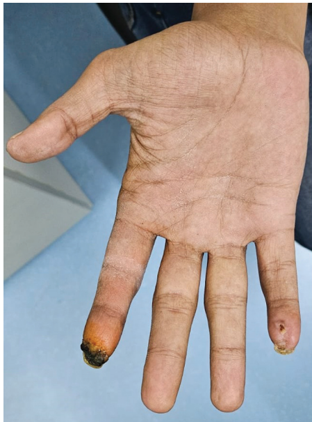
Fig. 3 Postoperative examination at 2 weeks shows significant wound recovery improvement.

decades, the incidence of TAO is decreasing, with an incidence of 0.10 to 0.04 per 100,000 persons-years from 2002 to 2011 in Taiwan. 9 A similar result was reported previously by Matsushita et al, where only 12 TAO patients were recorded between 1990 and 1996 compared with 46 patients between 1985 and 1989. 10 This phenomenon might have been attributed to improvements in the socioeconomic status and lower smoking rates throughout the entire period of observation. 9,10