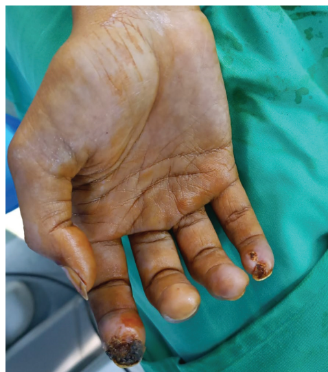
Fig. 1 Preoperative examination shows darkening of the tip of his right index.

The patient was given a 5,000-IU intravenous heparin injection followed by continuous infusion of 20,000 IU/24 h for 4 days. The patient was discharged on day 4 with clopidogrel 75 mg once daily, cilostazol 100 mg twice daily, and warfarin 2 mg twice daily and was followed up every