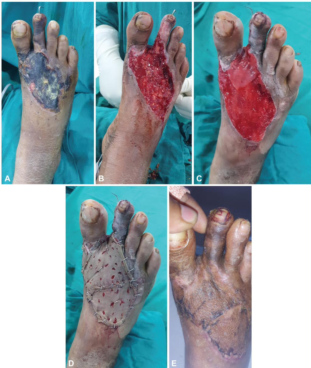
Fig. 4 (A) Necrotic tissue following trauma: right foot dorsum. (B) Soft-tissue defect exposing the extensor tendon and the metatarsophalangeal joint of the second toe: dorsum of the right foot. (C) Soft-tissue defect covered with dermal matrix. (D) Soft-tissue defect with dermal matrix covered with skin graft. (E) Late postoperative picture showing adequate healing and durable skin grafted site.

sessions, while chronic conditions like radiation illness might necessitate 50 to 60 sessions. 11-13 This pressurized environment can promote wound healing in several ways. The increased pressure can cause temporary vasoconstriction, leading to a reduction in swelling and edema around the reconstructed area. This can improve oxygen delivery to the newly grafted tissue with the dermal substitute. Hyperoxygenation within the chamber may stimulate the immune system by improving white blood cell function and their ability to respond to infection by effective phagocytosis. 13 Additionally, it can promote neovascularization in areas with low oxygen levels by stimulating fibroblast activity and capillary growth. 14 These factors can contribute to a more optimal integration of the dermal substitute and skin graft. Our study's findings suggest that HBO therapy allows for a