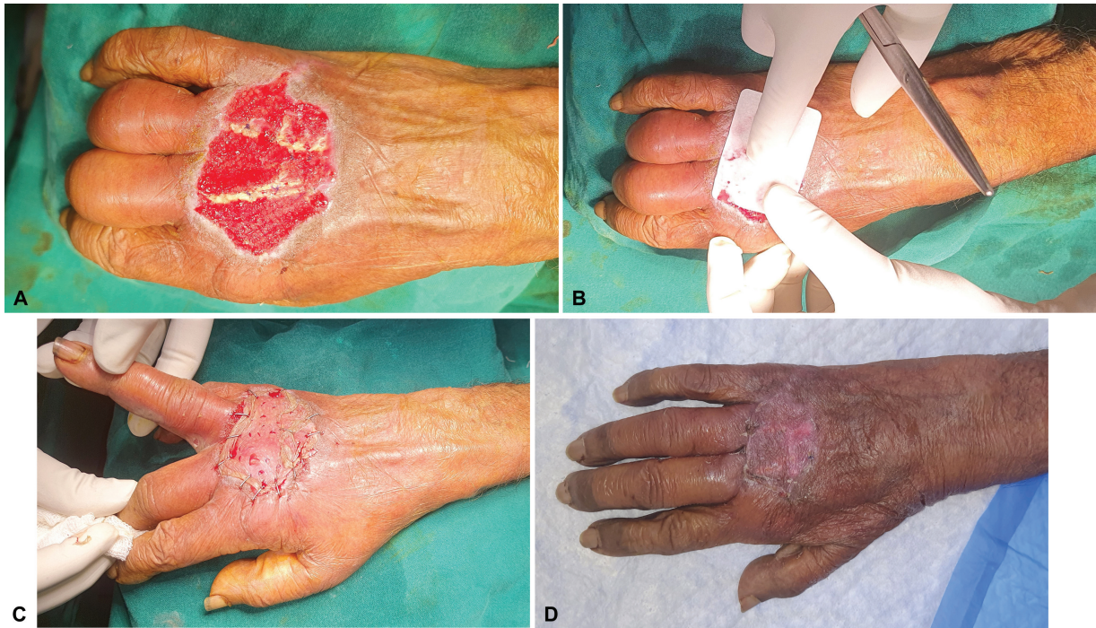
Fig. 3 (A) Soft-tissue defect exposing the extensor tendon: dorsum of the right hand. (B) Soft-tissue defect covered with dermal matrix. (C) Soft-tissue defect with dermal matrix covered with skin graft. (D) Late postoperative picture showing adequate healing and durable skin grafted site.

reconstruction, promoting regeneration in deep burns, chronic wounds, and full-thickness defects. Dermal matrix act as a scaffold, encouraging cell growth and neovascularization. 5 As the healing process progresses, the fibroblasts deposit new extracellular matrix, and the dermal substitute gradually resorbs. Studies have shown that various dermal substitutes have comparable engraftment and vascularization rates. 6 Notably, dermal matrix offers a distinct advantage as it allows for immediate STSG without compromising graft success. 7 Traditionally, dermal substitute placement involves a staged surgical approach. In stage 1, the wound is debrided, the dermal substitute is applied, and NPWT is used. Then, after a 1-week interval, stage 2 involves skin grafting with continued NPWT.