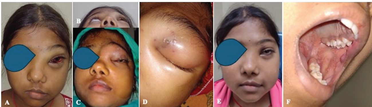
Fig. 1 (A) Left periorbital swelling with chocolate cyst and subconjunctival hemorrhages; (B) no proptosis; (C) lid edema immediately after bleomycin injection, day 0; (D) inflammatory edema worsen on day 1, with blisters appearing on day 2; (E) improvement at 6-month follow-up; (F) regressed oral mucosal lesions, which could be noticed as less deviation of the angle of the mouth, in (E) than in (A).

When the patient presented to us, she had a fresh episode of increasing pain and swelling of eyelids but no proptosis, accompanied by a chocolate cyst over the medial canthus and flaring up of oral mucosal lesions, which were not responding to any of the above medications (→ Fig. 1A, B ). Clinically, the left orbital lesion appeared to have ill-defined borders and depths extending over the adjacent periorbital region, ipsilateral temple, and cheek. Multimodal imaging revealed predominantly a microcystic LVM with combined,