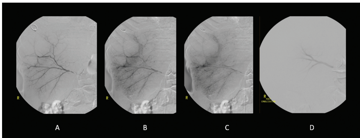
Fig. 2 Angiography via an aberrant right hepatic artery (A). Pooling of contrast (B, C) which may represent hepatic peliosis. The aberrant right hepatic artery was embolized with 700–900 \mu m polyvinyl alcohol (PVA) particles, after which distal contrast pooling resolved (D).

was selectively catheterized ( Fig. 2A ), and angiography showed pooling of contrast material with no active extravasation consistent with hepatic peliosis ( Fig. 2B, C ). The aberrant right hepatic artery was embolized with 700 to 900 \mu m polyvinyl alcohol particles with resolution of the distal contrast pooling ( Fig. 2D ).