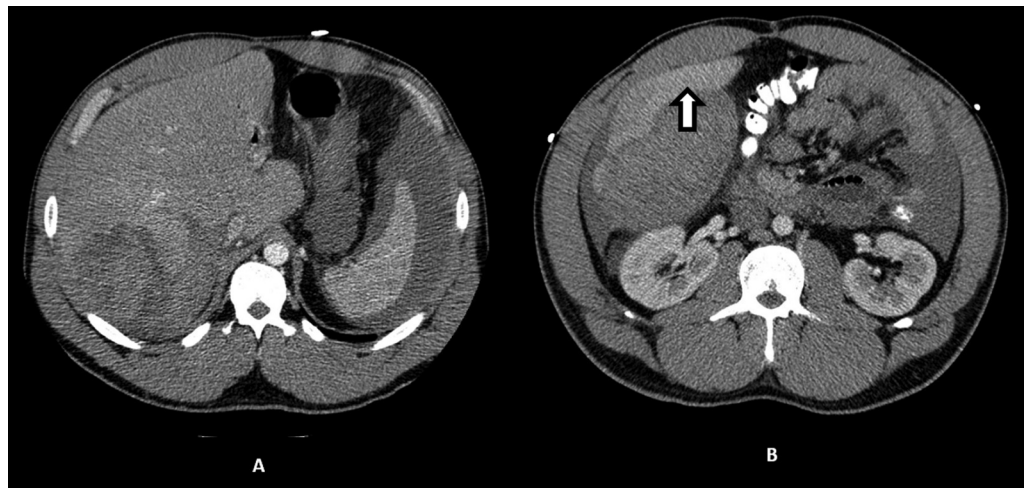
Fig. 1 Contrast-enhanced computed tomography (CT) scans done on day 1 (A) and day 3 (B) of current presentation showed an interval increase in the hepatic hemorrhage with new subphrenic and anterior perihepatic/subcapsular components (indicated by the white block arrow).