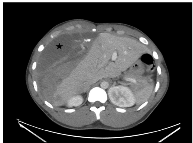
Fig. 3 An initial computed tomography (CT) scan of the abdomen showing a large right lobe subcapsular hepatic hematoma (indicated by the black star). An extensive mass effect was also noted, and hence an underlying mass lesion could not be excluded on the basis of this study.

A previously healthy 20-year-old male with a history of non-prescribed selective androgen receptor modulator (SARM) Ligandrol consumption and active use of 4000 mg N-acetylcysteine (NAC) presented with acute-onset severe right upper quadrant abdominal pain. CT scan revealed a large 25.7 cm subcapsular hepatic hematoma in the right lobe with active extravasation ( Fig. 3 ). The etiology of the extensive spontaneous bleeding was unclear. The hemorrhage may be secondary to an underlying hepatic adenoma or hepatic peliosis, difficult to visualize on imaging due to the hematoma’s size, compounded by a coagulopathic state possibly created or worsened by NAC use. 6 The underlying lesion may also be linked to prior SARM or undisclosed anabolic steroid use.