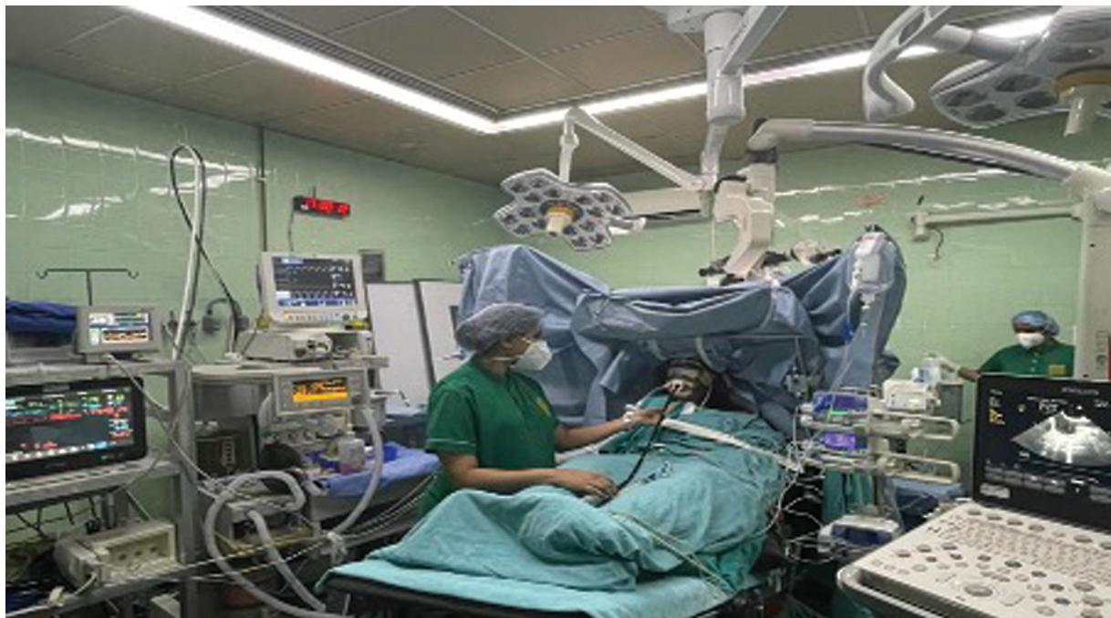
Fig. 2 Arrangement of the operating room in a patient undergoing craniotomy in the sitting position. This depicts the position of the anesthesiologist, the monitors, the workstation, and the echo machine.

The positioning of the anesthetist in relation to the patient is an important consideration. The patient's placement on the trolley, bed, or operating table imposes ergonomic challenges on the anesthetist. 1 Anesthetists come in various heights, and best practice dictates that the patient should be positioned at a height where the anesthetist can comfortably hold a facemask above the patient without bending their knees or back. This typically corresponds to the level of the umbilicus, T10 dermatome, or the waist of the anesthetist, as the spine naturally curves at this point. For optimal results, it is advisable to position the patient to enable the anesthetist to hold the facemask above them with a slightly flexed elbow and no shoulder strain. 1 The other shoulder should allow the hand to move quickly toward the reservoir bag at an angle of