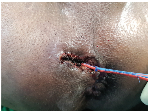
Fig. 2 The composite seton after application.

The composite seton was made by suturing together two silastic vessel loops of different colors (to help suturing) with 5-0 polypropylene continuous sutures for