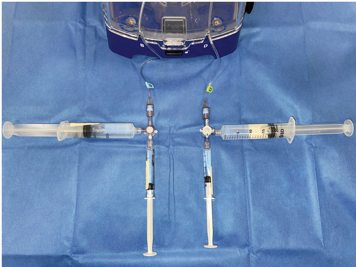
Fig. 2 Syringe setup and configuration during microvascular plug (MVP) assisted temporary vascular occlusion (TeVO) for microsphere loading and flushing.

In our original case series, the MVP was recaptured by handling the noncontaminated external portion of the delivery wire outside of the closed Y-adaptor. In brief, without loosening the hemostatic valve on the Y-adaptor, one could still advance the microcatheter along the pinned delivery wire and minimize release and exposure of adherent microspheres as the potentially contaminated segment of the wire is pulled outside the Y-adaptor. The newly exposed “hot”