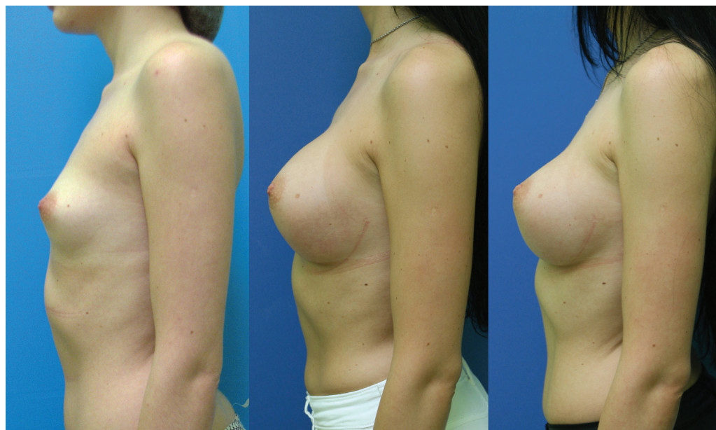
Fig. 3 Secondary nonadherence of polyurethane (PU) implant on the left side. Dynamics at 3 years, 7 months and 4 years after breast augmentation with PU implants.