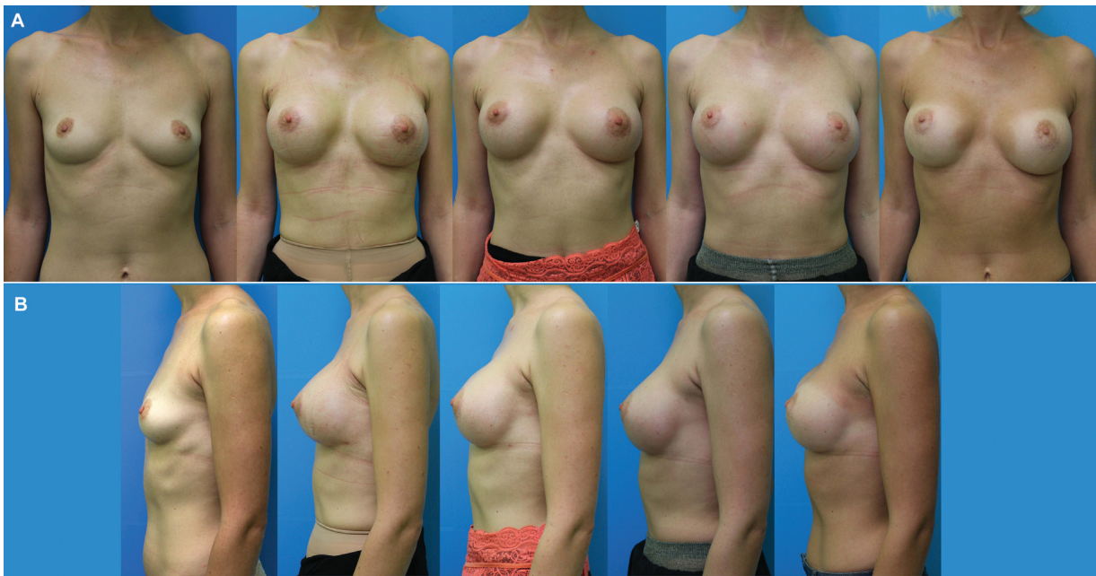
Fig. 1 (A, B) Primary nonadherence of polyurethane (PU) implants on the left side. Dynamics at 1, 3, 6, and 12 months after breast augmentation with PU implants.

Primary polyurethane implant nonadherence on the left side. Difference in implant position and movement. Patient is in vertical position. Online content including video sequences viewable at: https://www.thieme-connect.com/products/ejournals/html/10.1055/s-0043-1778644 .