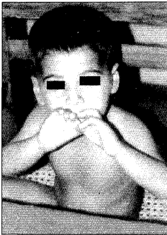
Figure 1: Pre-operative photograph of the patient showing backhanded posture