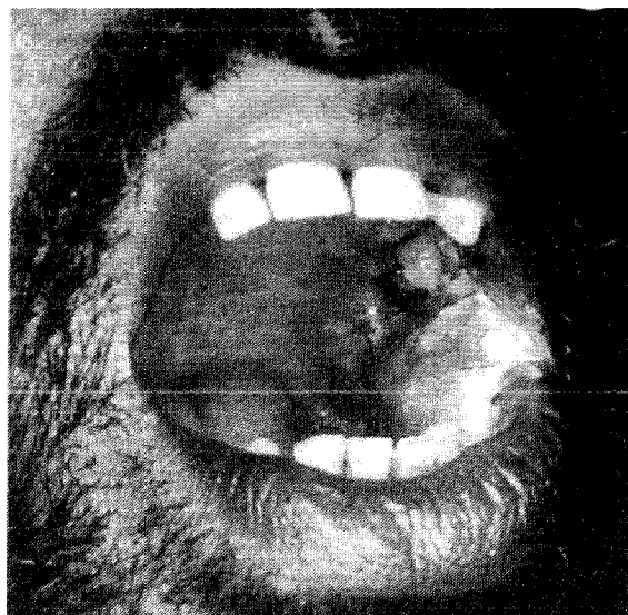
Fig 3b. Six month follow photograph after reconstruction with platysma myocutaneous flap