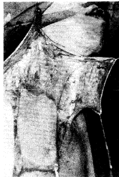
Fig 2. Photograph showing distal skin island after dissection of the flap