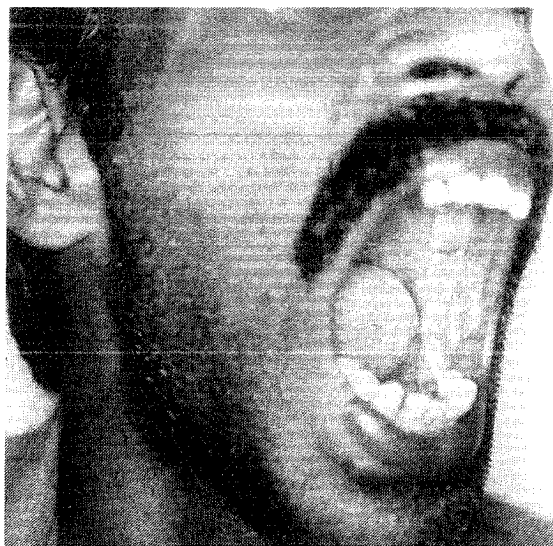
Fig 3a. Preoperative photographs showing carcinoma of buccal mucosa