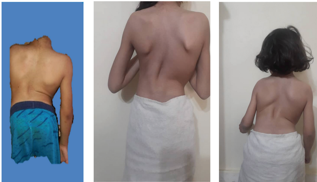
Fig. 1 Family A. Photos of family A (patients A1, A2, and A3) showed sever scoliosis.

normal vaginal delivery with no history of birth asphyxia. The patient was kept in nursery due to sever hypotonia, and also had a cleft palate, club feet, and bilateral undescended tests. Currently, the patient has a profound motor delay with head lag and unable to sit, his weight is 8,500g which is below the third centile on growth chart. The patient at 1.5 years started feeding by gastrostomy tube (► Fig. 2 ). He has recurrent hospital admissions due to recurrent chest infections.