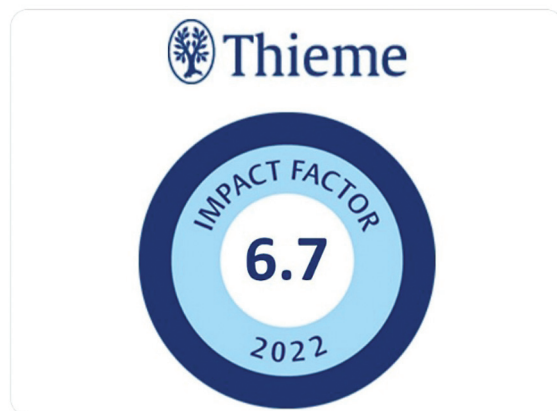
Fig. 2 TH impact factor social media release.

Wojta, extending our heartfelt gratitude for their dedicated contributions to the journal. Some have been long-standing dedicated Section Editors, occasionally for more than a decade (!), and it is with some sadness that we say goodbye.