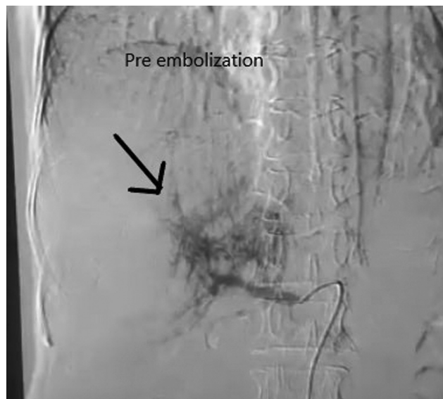
Fig. 2 Computed tomography angiography showing tumor thrombus status before transarterial chemoembolization done using doxorubicin and lipiodol.