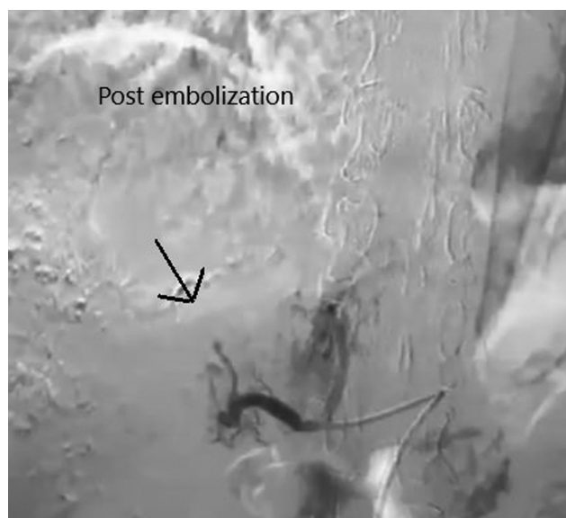
Fig. 3 Computed tomography angiography showing tumor thrombus status after transarterial chemoembolization done using doxorubicin and lipiodol.

therapies (immunotherapy), but the patient and her relatives refused. Transarterial chemoembolization was done using doxorubicin and lipiodol as shown in ►Fig. 2. Postembolization scan of the liver is shown in ►Fig. 3. Patient was started on antihepatitis B drugs (tab entecavir 0.5 mg once daily), oral propranolol, and other palliative treatment. On follow-up after 1 month, patient was doing well.