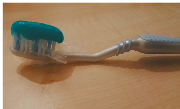
Fig. 1 Manual toothbrush head and a quantity of toothpaste consumed in a timeframe.

Each subject was given a 15-mL tube of toothpaste (AZ Pro-Expert, Gross-Gerau, Germany) for use with the manual and electric toothbrush. All participants used the same product to limit the variability of the results. According to their daily habits, each subject extracted a dose of toothpaste from the tube to place it on the brush head for manual and electric toothbrush, then it was taken and weighed with a precision balance of sensitivity equal to 0.01 g. The amount of toothpaste consumed was recorded thrice daily (T0, T1, T2). At the end of the study, the toothpaste tubes were weighed with the same precision balance to determine the total individual amount of product used. Toothbrush types with the amount of toothpaste consumed are shown in ►Figs. 1 and 2.