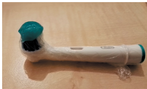
Fig. 2 Electric toothbrush head and a quantity of toothpaste consumed in a timeframe.