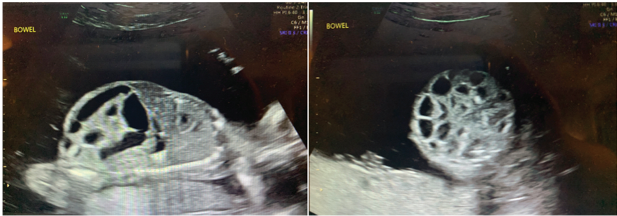
Fig. 1 Antenatal ultrasound at 20 3/7 weeks showing diffusely dilated fetal loops of bowel.

Serial amnioreductions were performed nine more times for maternal symptoms between 27 4/7 and 31 5/7 weeks, with amniotic fluid indices ranging from 25.7 to 47.4 cm and volume of amniotic fluid removed during the procedures ranging from 3,900 to 4,700 mL. Serial ultrasounds revealed normal fetal growth and continued to show diffusely dilated loops of bowel with normal peristalsis.