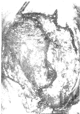
Fig.3 Intra-operative photograph showing distally based latissimus dorsi muscle tunneled into the abdominal wall defect

The reconstructive surgery was performed under continuous epidural anaesthesia with local anaesthetic supplementation in the axilla. Skin graft and fibrous tissue adhesions at the hernia site were fully excised and all peritoneal rents at various places were repaired using absorbable sutures. The peritoneum was then covered with a marlex mesh, which was secured to the part of external oblique and rectus abdominis muscles on the superior and medial aspects respectively. The lateral and inferior margins of the mesh were left unsutured at this stage. The patient was then turned to the lateral position for the dissection of latissimus dorsi muscle flap. By an incision along the posterior axillary fold, the latissimus dorsi muscle flap was raised, keeping its thoracodorsal pedicle and lumbar and paraspinal perforators intact. The entire length of the muscle was freed from its skin and sub-muscular attachments. A subcutaneous tunnel was created, connecting the lateral edge of the abdominal wall defect to the incision for harvesting of the latissimus dorsi muscle, along the posterior axillary fold. Haemostasis was achieved and the flap was wrapped in warm sponges. The patient was then turned supine and the marlex mesh was secured on to the lateral aspect of the abdominal wall defect. The thoracodorsal pedicle and tendinous insertion of the latissimus dorsi muscle were