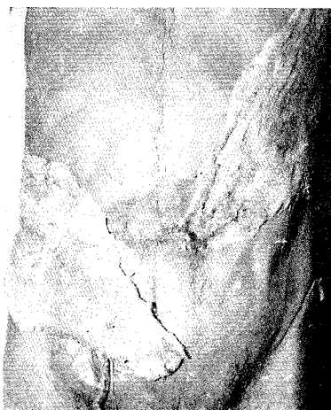
Fig.1 Cadaveric dissection showing the arc of rotation of latissimus dorsi muscle based on the thoracodorsal vessel. Left side : It covers supra-umbilical region based on paraspinal perforators. Right side: It reaches to the infra-umbilical region.

A 25 year old male presented with a massive abdominal wall defect with ventral hernia. The patient had a history of postoperative progressive synergistic gangrene (necrotizing fasciitis) following laparotomy for an acute abdominal pathology in childhood. The abdominal wall defect was then salvaged with skin grafts. Over a period of time he had developed a huge ventral hernia (Fig.2). The