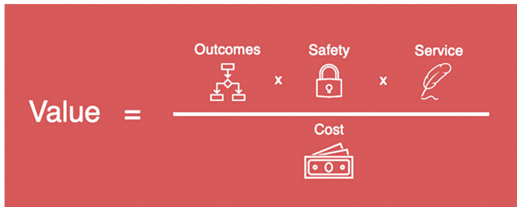
Fig. 1 The Healthcare Value Equation developed by Porter et al describes the value of care provided as the ratio of outcomes, safety, and service to the total cost of the care provided.