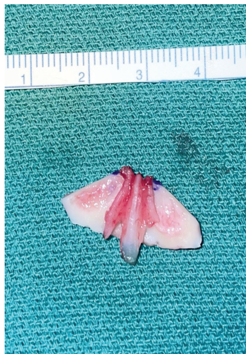
Fig. 2 This is the resected dorsal septum/ULC articulation (DSA) segment overlaid on the BFG, demonstrating matching cephalocaudal dimensions of graft with resected DSA. BFG, butterfly graft.

An intercartilaginous incision is made between the ULC and lower lateral cartilages. The ULC and dorsal septum are freed in a subnasal superficial muscular aponeurotic system (SMAS) plane to the rhinion, then dissection proceeds cephalically to the nasion in a subperiosteal plane. Next, an incision is made in the coronal plane, as caudally as possible, to include the anterior septal angle, allowing for graft inset. The concept is to match the removal of the dorsal septum/upper lateral crural articulation segment to the carved BFG dimensions, which can be seen in → Fig. 2. The ULC is further released from the septum to allow for mobility during inset. The BFG is initially secured to the medial and caudal corner of the ULC to center the graft. Then lateral sutures are placed to complete the valve opening, using 5-0 Polydioxanone suture on a P-2