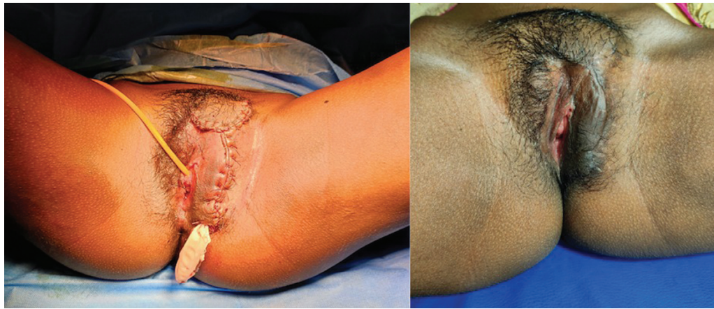
Fig. 3 Postoperative images of the vulva immediately and 1 month after the surgery.