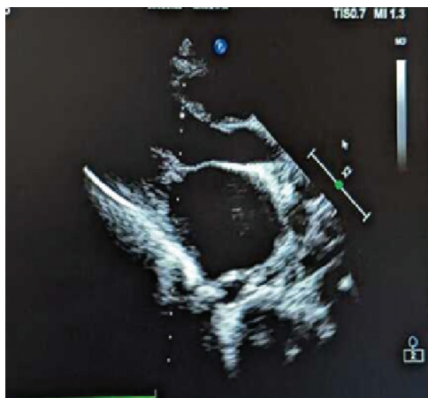
Fig. 5 Transthoracic echocardiography demonstrating a dilated right ventricle.

appointments for follow-up care with our outpatient cardiology clinic for serial echocardiography and hematology for additional workup. Additionally, our case study emphasizes the significance of early disease detection. Patient was doing well both clinically and biochemically (eosinophil count was 3) after 1 month of follow-up.