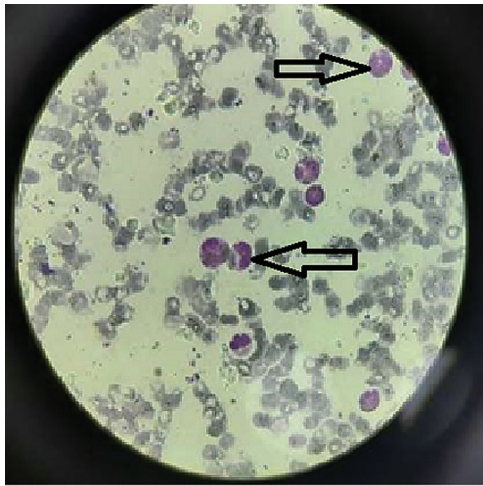
Fig. 3 Peripheral smear of the patient showed eosinophilia (empty arrow).

tuberculosis, diabetes mellitus, or systemic hypertension or any other co morbidities. Patient denied of having any allergies to drugs and other substances. Patient did not have any prior history of hospitalization. General condition at presentation was stable, febrile on touch with temperature of 99°F, pulse of 92 beats per minute, blood pressure of 100/70 mm Hg, respiratory rate of 20/min, and abdominal examination showed suprapubic tenderness and guarding with no rigidity or organomegaly. Respiratory system examination and cardiac examination were within normal limits. Ultrasound of abdomen was done which showed normal study.