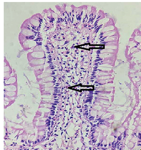
Fig. 2 Sections stained with hematoxylin and eosin stain (high power view 40x) showing unremarkable villi, deeper tissue showing fibrocollagenous stroma with extensive acute on chronic inflammatory infiltrates predominantly eosinophils along with lymphocytic infiltrates, and section also showing unremarkable submucosal glands, suggestive of Eosinophilic enteritis (empty arrow).

the patient had no symptoms and repeat complete blood count showed a normal white blood cell count with a normal eosinophil level. Patient was followed up after a period of 1 month and was doing well.