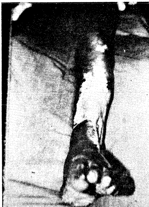
Fig. 1. Pre-operative appearance of soft tissue loss at the fracture site of lower third leg (Lt.).