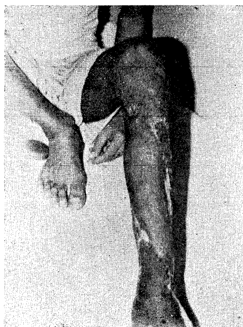
Fig. 4. Post-operative photograph—six weeks after surgery.