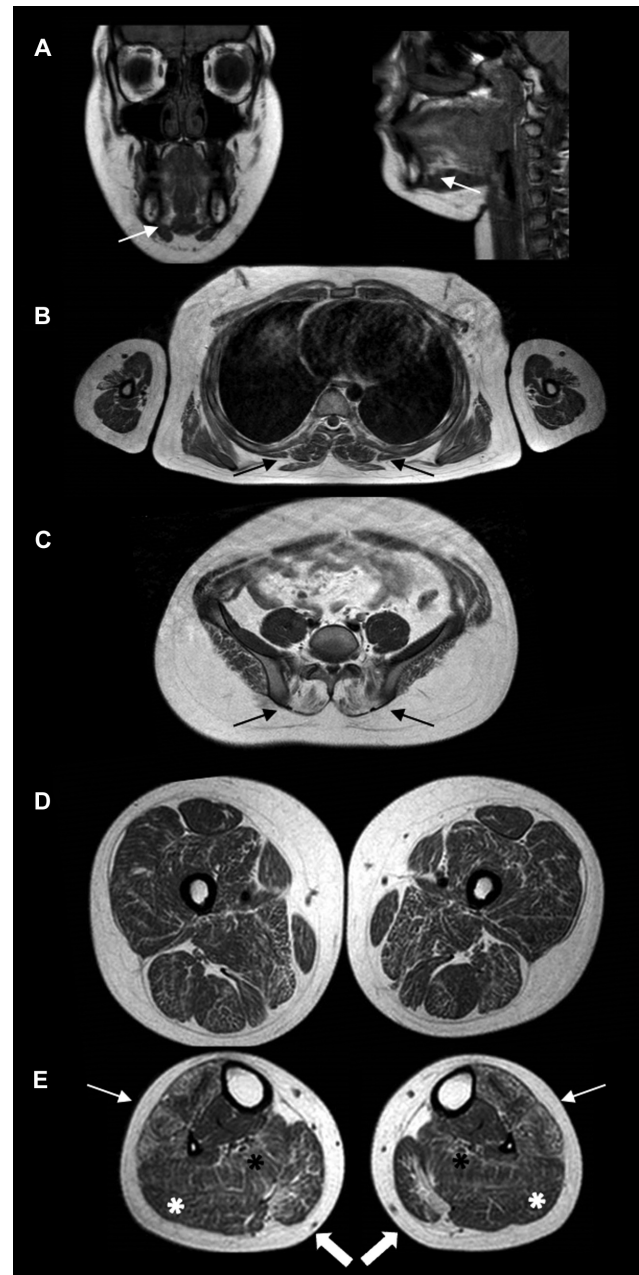
Fig. 2 Representative images of T1-weighted whole body muscle magnetic resonance imaging (MRI) scans at 13 years of age are shown. Cranial scans displayed fatty substitution of the tongue (white arrow) (A). Paraspinal muscles were spared at the thoracic level (black arrows) (B) while involved at the lumbar one (black arrows) (C). Thigh scans showed a mild diffuse involvement (D); in the lower leg, the anterolateral compartment (tibialis anterior, extensor digitorum longus, peroneus longus) (white arrows) and medial gastrocnemius were mostly affected (white thick arrows), the latter with a subfascial rim of fatty replacement, with sparing of the lateral gastrocnemius (white asterisk). Soleus was affected to a lesser extent, more prominently in the distal part (black asterisk) (E).

Conversely, muscle MRI pattern did not entirely recapitulate previous reports. MRI studies on EDMD1 are limited (summarized in ►Supplementary Fig. S1, available online only), and pediatric MRI data are scarce. The first MRI study on genetically determined EDMDs aimed to detect a specific