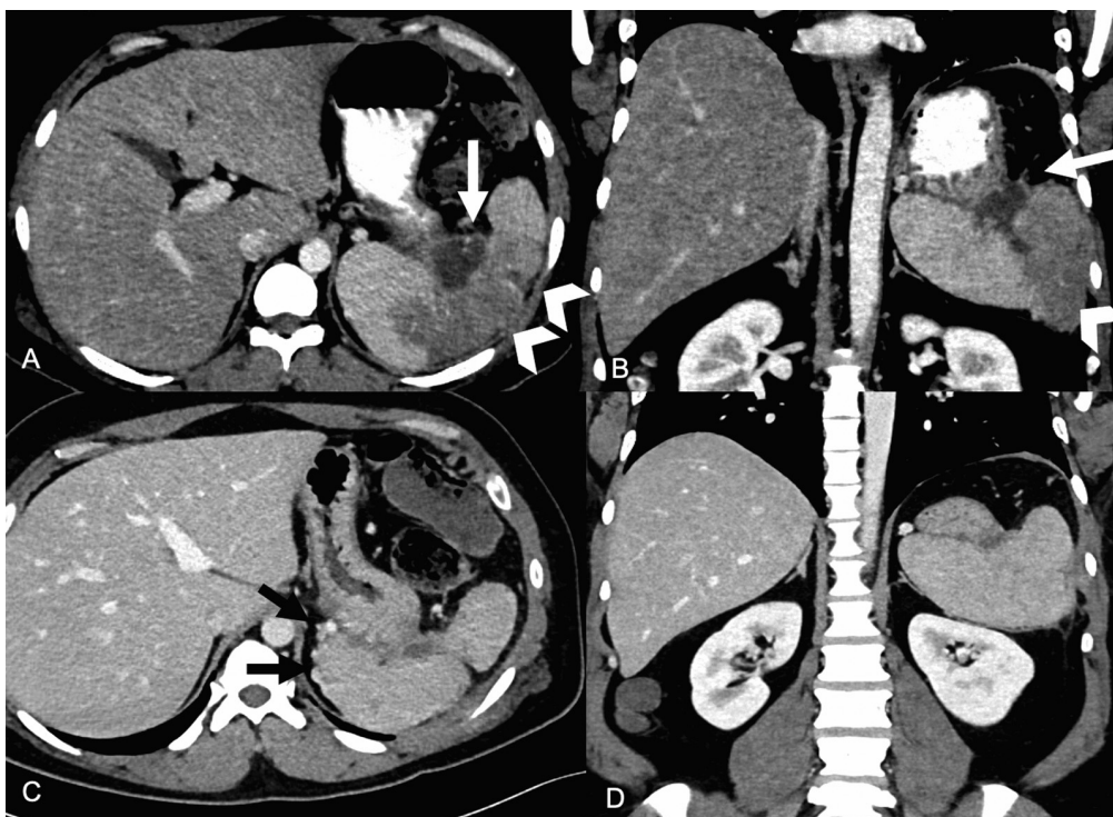
Fig. 1 Contrast-enhanced computerized tomography (CT) images in portal venous phase. (A) Axial and (B) coronal images at first presentation show a peripherally enhancing fluid collection (white arrows) in gastrosplenic ligament and splenic hilum. Splenic vein thrombosis with perfusion changes and hypodense areas (arrowheads) were present in the spleen. After percutaneous aspiration and 3 months of medical treatment, (C) axial and (D) coronal images show significant resolution of the splenic hilar collection and perfusion changes in the spleen. Venous collaterals (black arrows) are noted in perisplenic region.

The diagnosis rests on the culture of the organism from blood, throat, or rectal swabs or the aspirated pus in cases with localized abscess. As cultures have a low sensitivity for diagnosis, repeated culture is necessary for patients with suspected melioidosis. The treatment of melioidosis rests on an early diagnosis and timely starting of antimicrobials specific for B. pseudomallei . Antimicrobial therapy consists