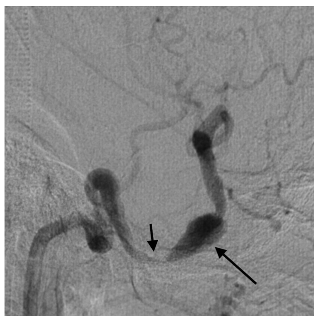
Figure 4 Angiography demonstrating focal stenosis of the right cavernous internal carotid artery due to thrombus compression (short arrow), followed by an aneurysmal dilation (long arrow), with no opacification of the previously-described thrombosed part.

intracranial vascularity: State of the field and future directions. AJNR Am J Neuroradiol 2020;41(01):2-9