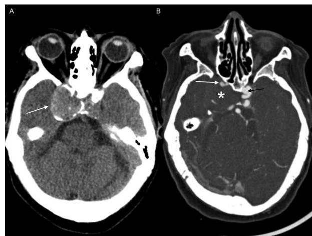
Figure 1 Unenhanced axial computed tomography (CT) scan (A) and CT angiography (B) showing a hyperdense mass adjacent to the right cavernous sinus with peripheral calcifications (arrow in A) and no enhancement (asterisk in B), opacification of the pervious internal carotid artery (white arrow in B), and a small contralateral aneurysm (black arrow).

A 62-year-old female with a previous history of 2 ischemic strokes presented with sudden headache and left hemiparesis. Imaging revealed a partially-thrombosed right cavernous carotid artery aneurysm (► Figures 1 and 2 ). Vessel wall imaging showed an extensive vascular wall enhancement of the parent vessel, which might be related to vasa vasorum or inflammation (► Figure 3 ). The role of vascular inflammation within the defective areas of the aneurysm are well known. However, less explored are the inflammatory changes of the parent vessel, which can be detected by magnetic resonance (MR) angiography (► Figure 4 ) and indicate a pathologic artery more subject to aneurysmal formation and thrombotic events. 1,2