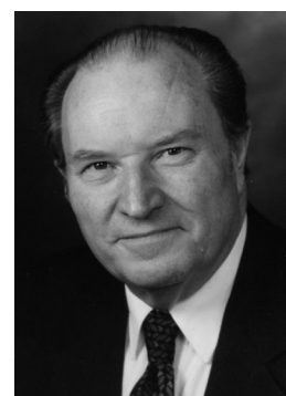
Fig. 1 Eberhard F. Mammen (1930–2008).

Further details of the awards and the award winners are posted online ( https://www.thieme-connect.com/products/ejournals/journal/10.1055/s-00000077 ), and previous award winner announcements are also available in print (see ► Table 1 ).