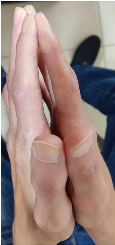
Fig. 6 Image of the patient's hands showing thinning of the skin consistent with sclerodactyly in addition to dryness and cracking of the skin over the radial aspect of the digits with tapering of the digits.

revealed a polyclonal pattern, but the rest of the autoimmune workup was unremarkable. He had thrombocytosis, but his hemoglobin was normal, and the rest of CBC was unremarkable. Lactate dehydrogenase (LDH) was high at 873 \mu\text{L} (reference range: 1.9–2.65 \mu\text{L} ) and there were elevated levels of aspartate transaminase (AST) at 82.4 \mu\text{L} (reference range: 0–37 \mu\text{L} ) and alanine transaminase (ALT) at 71.7 \mu\text{L} (reference range: 0–42 \mu\text{L} ).