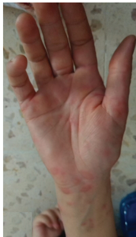
Fig. 4 Raised pruritic erythematous skin eruption involving the volar aspect of the palm, wrist, and forearm.