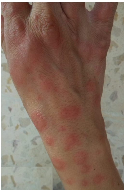
Fig. 3 Raised erythematous pruritic skin eruption involving the dorsal aspect of the right hand.