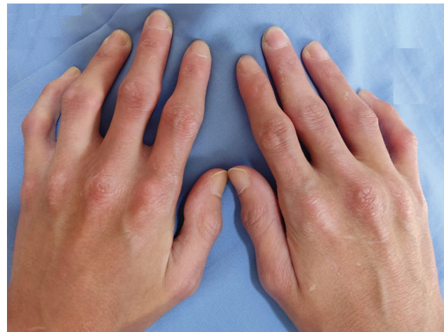
Fig. 1 Images of the patient hands showing thickening of the skin distal to the metacarpophalangeal joints (MCP), interosseous muscle wasting and hyperkeratosis, scaly eruption of the skin involving the MCPs, and proximal interphalangeal joints.

In addition, he had a 5-degree flexion contracture and a limited range of motion in his elbows. Flexion contracture at the proximal interphalangeal (PIP) and distal interphalangeal (DIP), as well as fissuring and skin dryness, was present involving the second, third, and fourth digits (►Fig. 6). The upper extremities had a power of 4/5, while the proximal extremities had a power of 3/5. The patient was unable to stand from the seated position without assistance or without using his upper extremities. Cervical flexors and extensors were noticeably weak. The modified Rodnan skin score