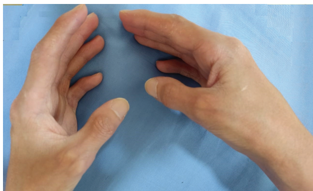
Fig. 2 Images of the patient hands showing a nonpruritic, hyperkeratotic, and scaly eruption on the ulnar side of the thumb and radial side of other fingers.