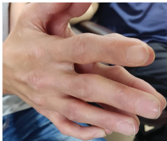
Fig. 5 Images of the patient hands showing thickening of the skin distal to the metacarpophalangeal joints (MCP), interosseous muscle wasting and hyperkeratosis, scaly eruption of the skin involving the MCPs and proximal interphalangeal joints.

(MRSS) was 14. A pulmonary examination showed bibasilar crackles. The rest of the physical examination was unremarkable.